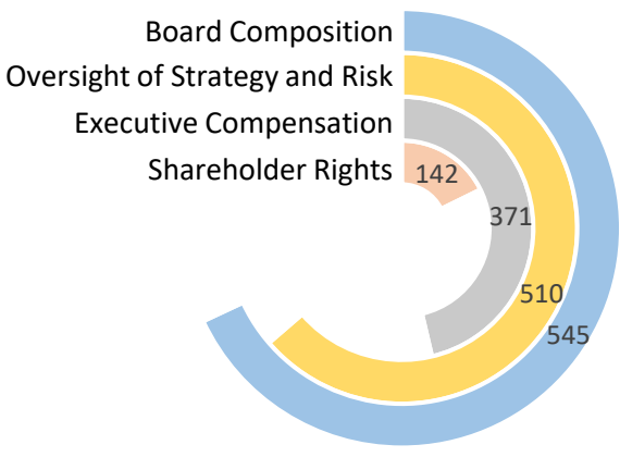
Figure 1. Engagements by Primary Topic

# of engagements, 1H 2022 2022 Investment Stewardship Semiannual Report, Appendix