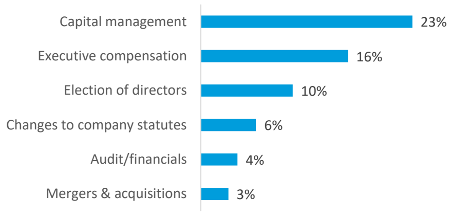
Figure 2. Votes Against Management

% of votes against Management for year ended June 30, 2022